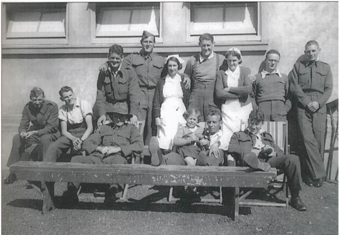
Recuperating servicemen with their nurses outside College hospital - 1942