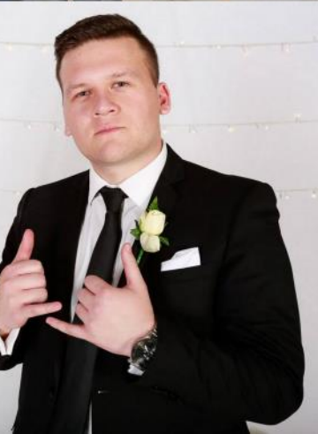
Commercial - Portrait - Wedding www.wyeggyphotography.co.nz 2015 Formal