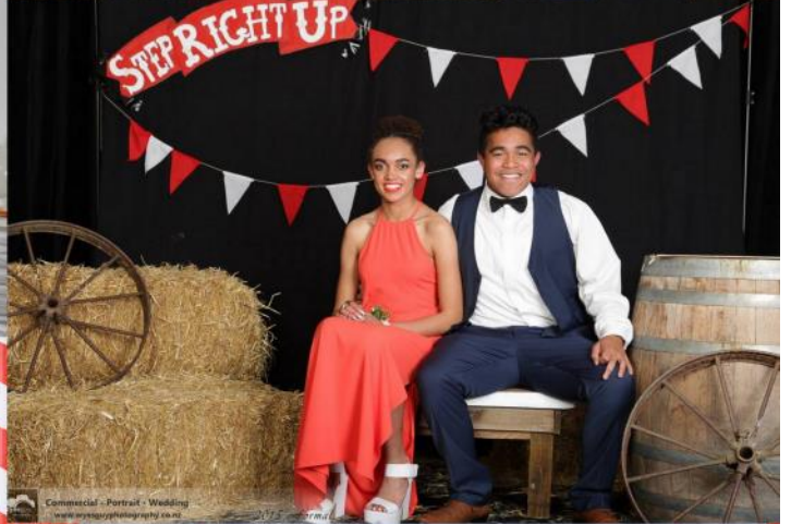
Commercial - Portrait - Wedding www.wyeggyphotography.co.nz