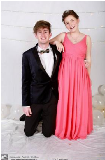
Commercial - Portrait - Wedding www.wyeggyphotography.co.nz 2015 Formal