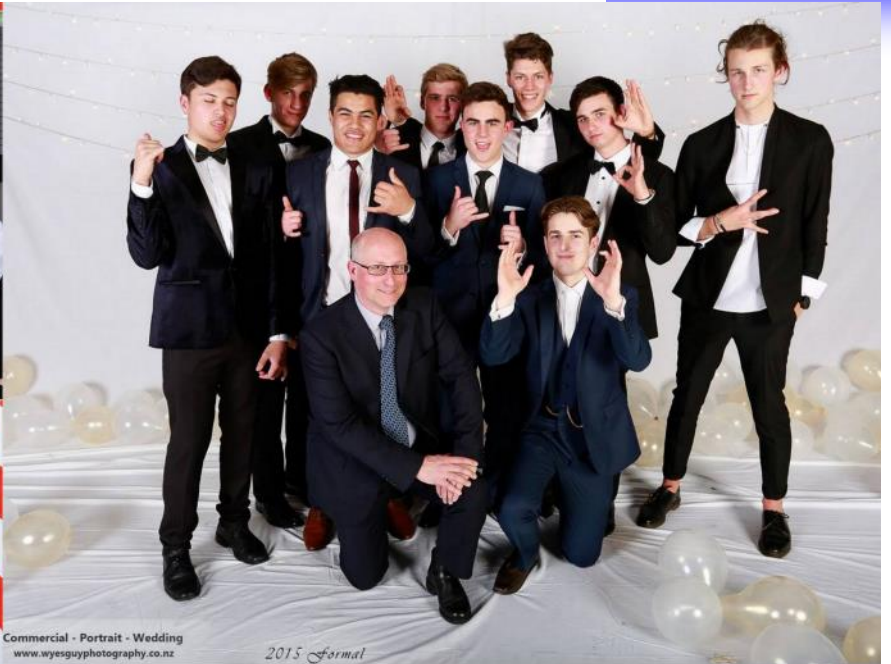
Commercial - Portrait - Wedding www.wyesguyphotography.co.nz