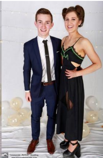
Commercial - Portrait - Wedding www.wyeggyphotography.co.nz