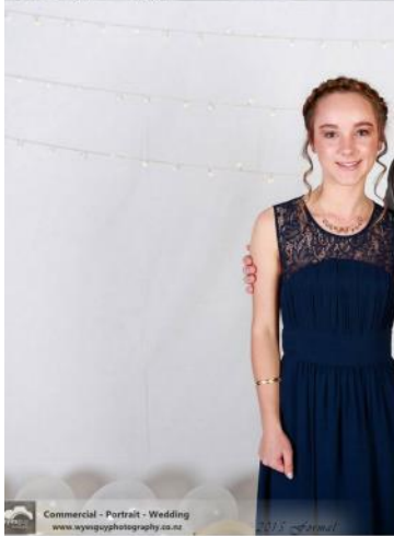
Commercial - Portrait - Wedding www.wyeggyphotography.co.nz 2015 Formal