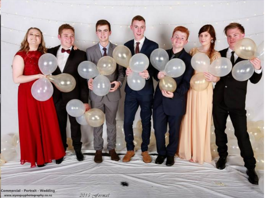
Commercial - Portrait - Wedding www.wyesguyphotography.co.nz