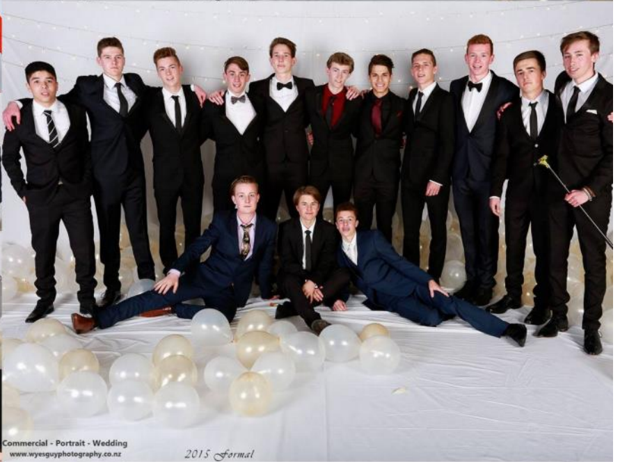
Commercial - Portrait - Wedding www.wyesguyphotography.co.nz