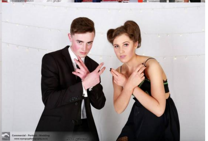
Commercial - Portrait - Wedding www.wyeggyphotography.co.nz 2015 Formal